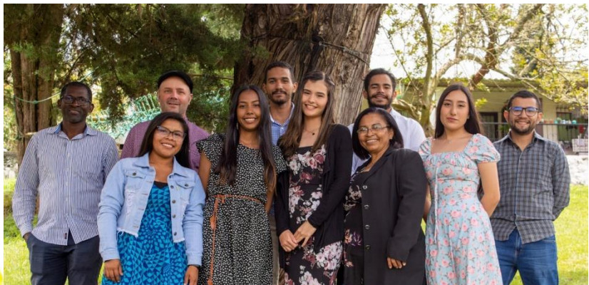
My End Times and Defending the Faith class

events! We are sooo close to the end! Soon we will be with the King of kings forever!!! As I looked at a street in Bogotá, I thought, “This hasn’t changed much; but it will all be gone soon! Studying prophecy has made me more aware of how temporal this world is.